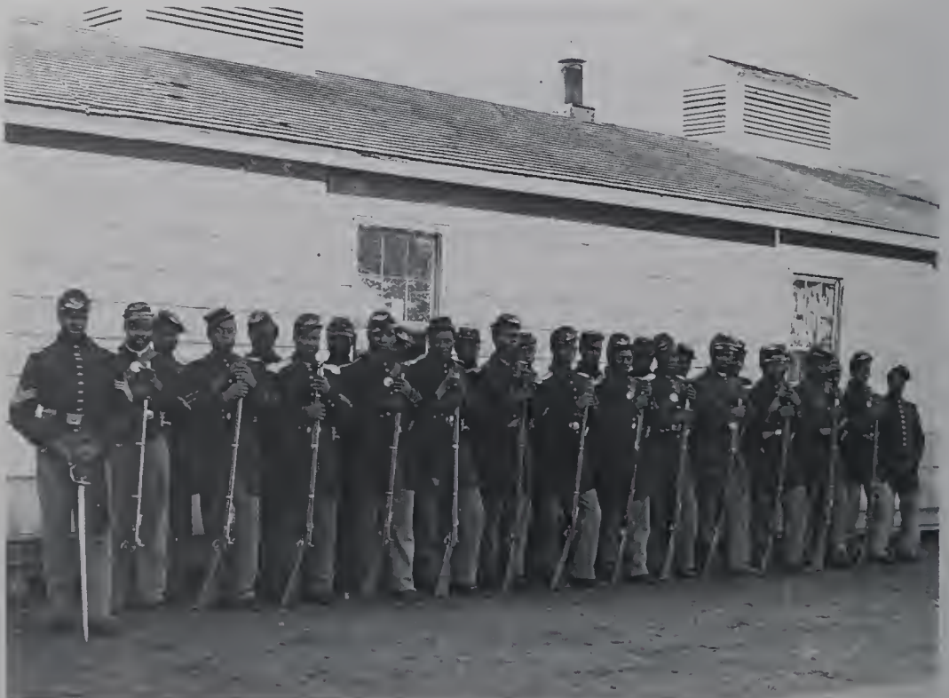
Company E, 4th U.S. Colored Infantry, at Fort Lincoln, Kansas, November 17, 1865.